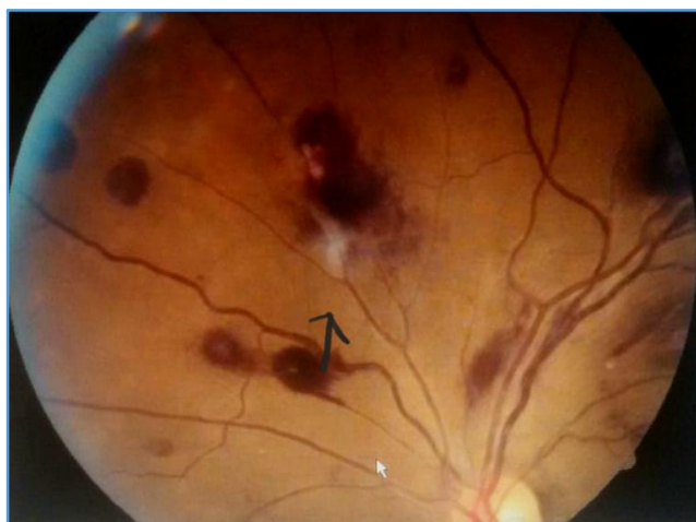
Figure 1. Pre-retinal Haemorrhages with Cotton Wool Spots in a patient with Severe Anaemia

Chi-square (x 2 ) = 17.758, df = 8, p < 0.05 * (Statistically Significant).