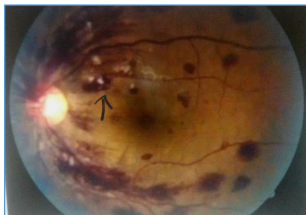
Figure 3. Flame-Shaped Haemorrhages with Cotton Wool Spots in Severe Anaemia